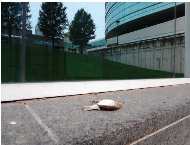
FIGURE 1. A Swainson's Thrush killed by colliding with the window of a low-rise office building on the Cleveland State University campus in downtown Cleveland, Ohio.

Research on bird–building collisions typically occurs at individual sites with little synthesis of data across studies. Conclusions about correlates of mortality and the total magnitude of mortality caused by collisions are therefore spatially limited. Within studies, mortality rates have been found to increase with the percentage and surface area of buildings covered by glass (Collins and Horn 2008, Hager et al. 2008, 2013, Klem et al. 2009, Borden et al. 2010), the presence and height of vegetation (Klem et al. 2009, Borden et al. 2010), and the amount of light emitted from