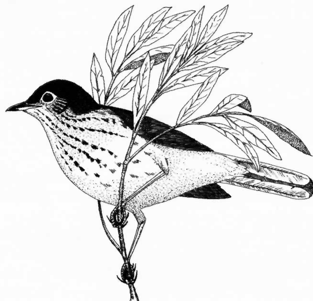
Swainson's Thrush by George West